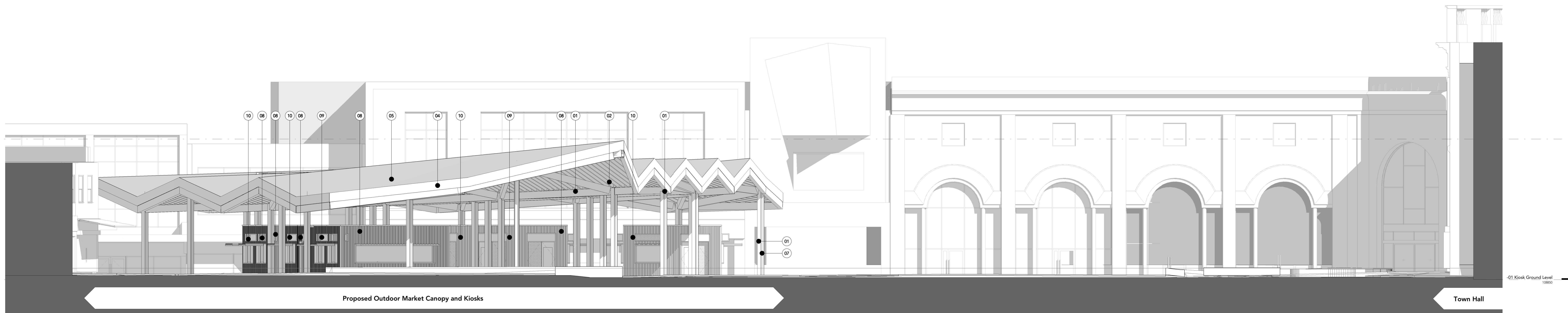
02 Proposed West Elevation 1:100

P02 31.07.2023 Planning Amendment: Canopy Roof levels amended to suit agreed increase in level. P01 JUNE 2023 PLANNING ISSUE Rev Date Isss Details © The copyright of this drawing is reserved. This drawing and design is the sole property of Buttress Ltd and must not be reproduced without permission. Buttress Ltd, Regent Road, Salford, Greater Manchester, M6 6PU